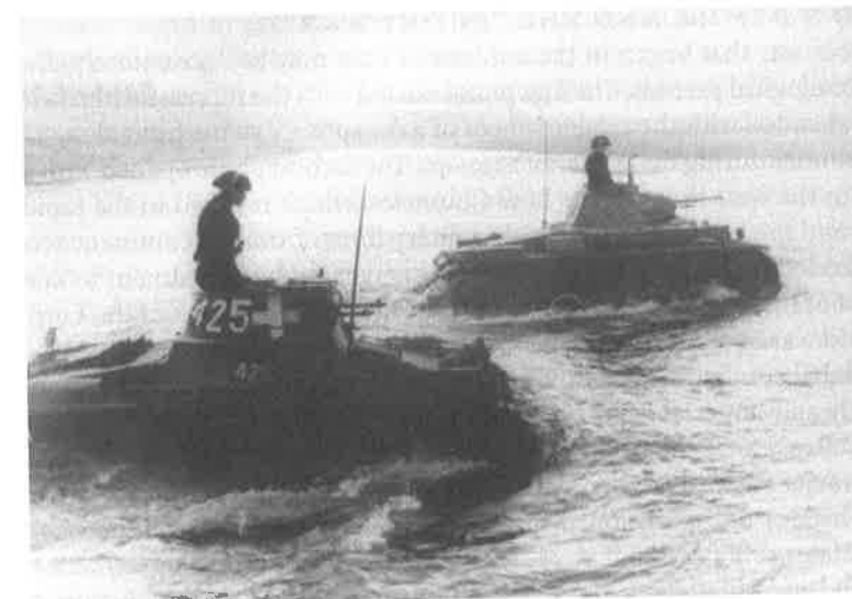
The first test of Blitzkrieg ("Lightning War"). Two tanks of the SS-Leibstandarte Adolf Hitler Division cross the Zora River during the German invasion of Poland in September 1939. The German army's successful use of tanks and aircraft to achieve rapid penetration of the Polish defenses would be repeated in the spring of 1940, when the French army was overwhelmed by this new tactic in six weeks.