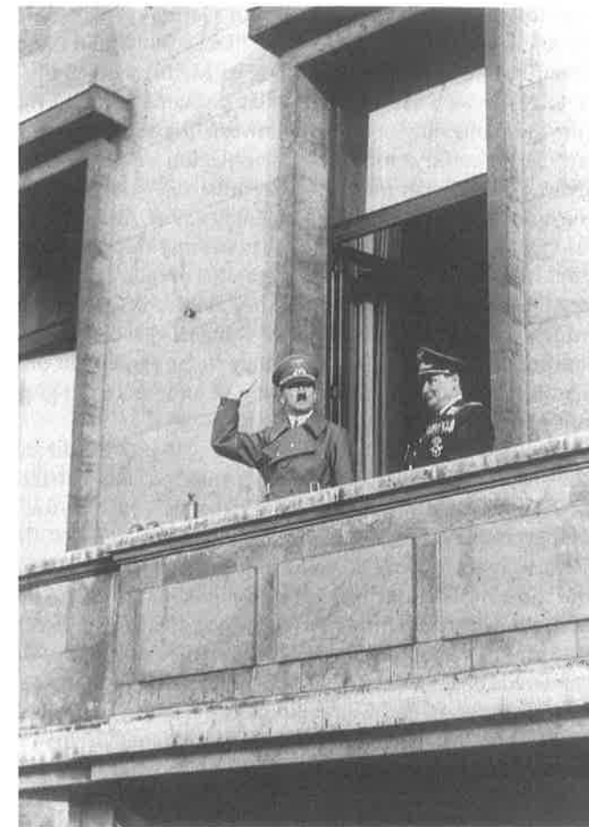
Adolf Hitler (1889–1945) with Herman Goering at Reichs Chancellery, 1938: This native Austrian has just engineered Germany's absorption of German-speaking Austria and is preparing to annex the German-speaking region of Czechoslovakia known as the Sudetenland. Both acts were cynically justified on the grounds of President Wilson's hallowed principle of national self-determination.

had revealed that neither London nor Paris was any more willing to risk a European war by intervening on Austria's behalf than was Mussolini. On April 10 a rigged plebiscite resulted in an overwhelming vote for the unification of Hitler's adopted country and the land of his birth.